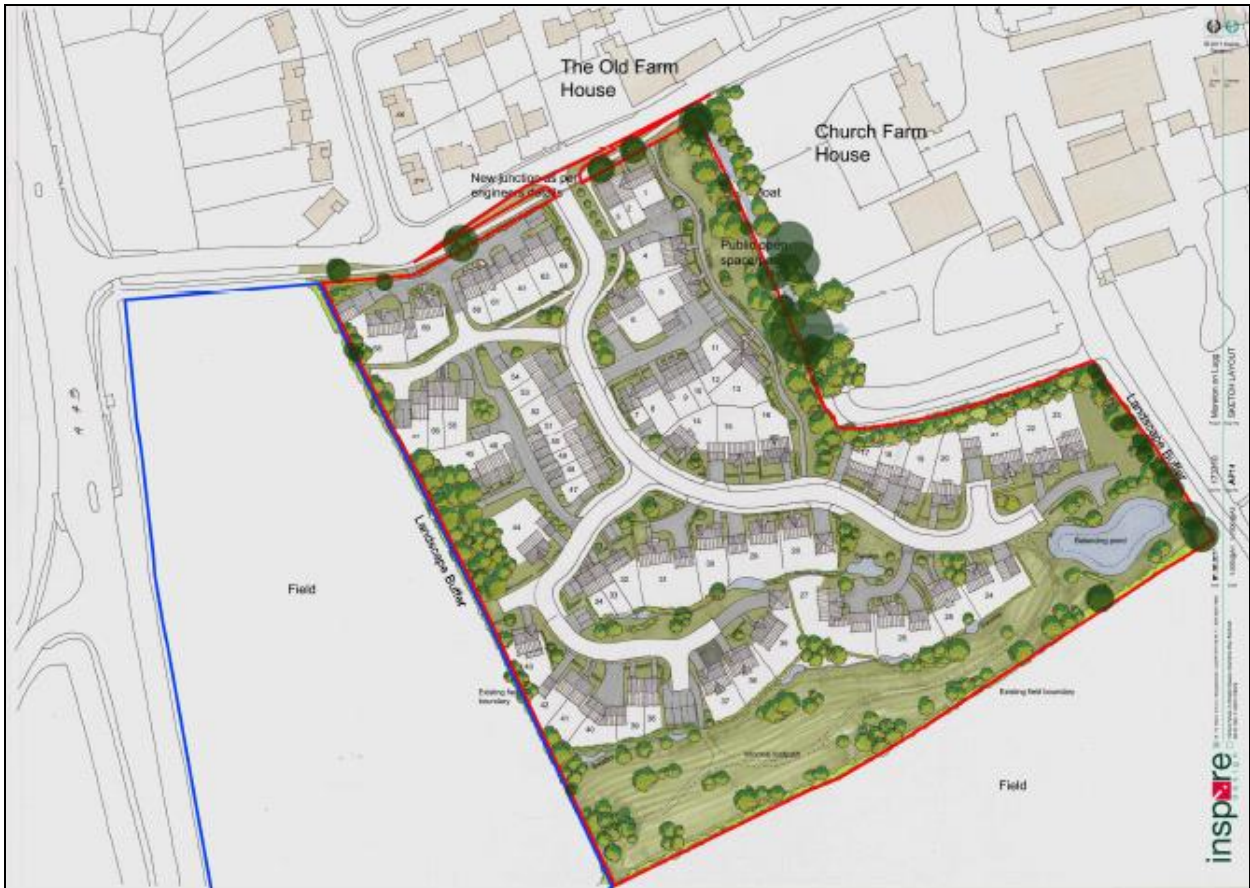
Indicative Sketch Layout

1.5 The proposals do not at this stage stipulate the range or mix of housing to be provided.